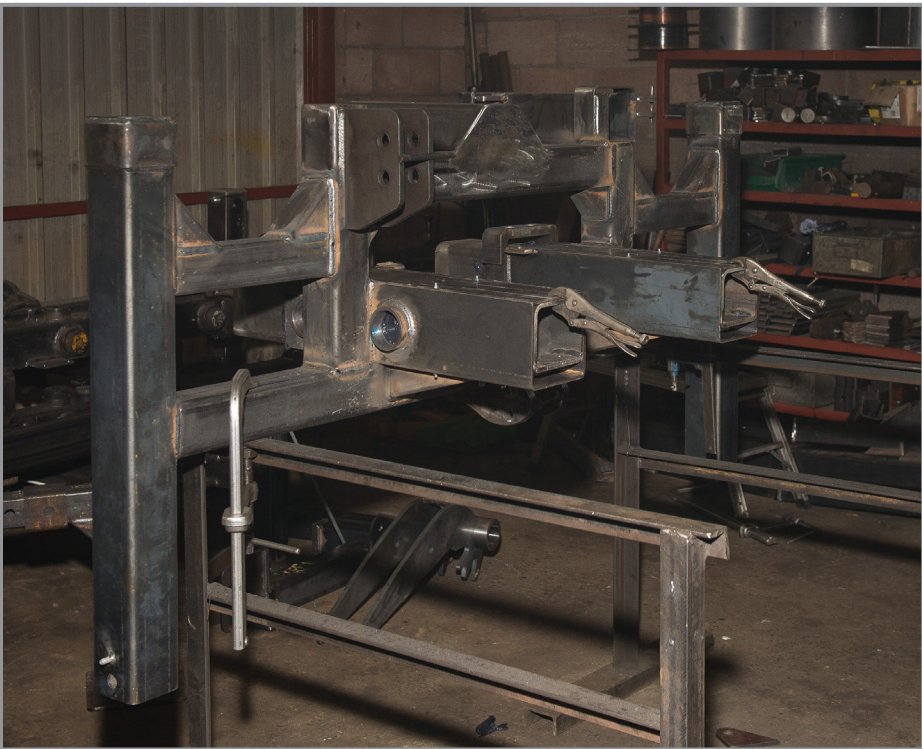
WORK ON another Bryce Suma post driver in progress in the workshop

They can drive heavy metal piles and hole punchers, or put in big, heavy, straining posts in less than a minute.