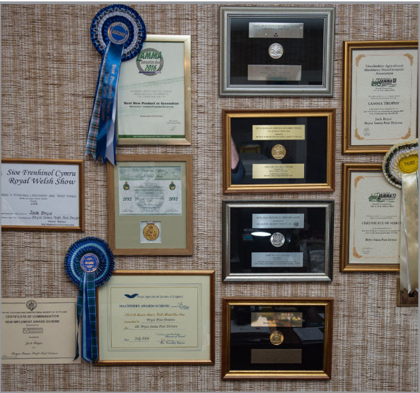
A GLITTERING array of the accolades, won by Bryce Suma products over the years Ref:RH191217007

"Our staff are at the core of the business, and they really